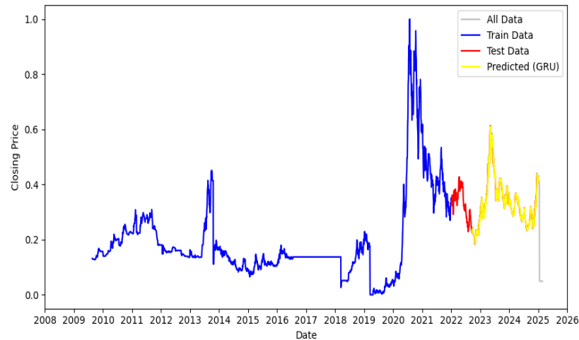
Fig. 5. GRU forecast chart.

The results of the criteria for evaluating the accuracy of the GRU model are as follows: